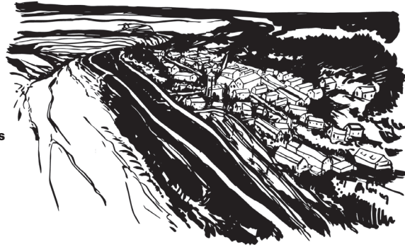
Mühlrose - Miloraz

The coal business in Eastern Germany was acquired from the Swedish state-owned company Vattenfall by the EPH group owned by the Czech coal baron Daniel Křetínský in 2016. Four of his power plants in this area have emissions equal to a half of emissions of the Czech Republic and they rank among the worst in Europe both in terms of CO2 and toxic emissions. Expansion of the mines has been threatening people's homes, historically having had the worst impact the local Lusatian Serb minority. At the time of publishing this report, LEAG was demolishing the village of Mühlrose - Miloraz, despite the fact that it did not yet have a permit to mine coal under it. For the planned cessation of mining in 2038, Křetínský lobbied for „compensation“ of 1.75 billion Euros from the German government – apparently under the risk of arbitration lawsuits. This is despite the fact that this amount, even according to a leaked internal analysis by the German Ministry of the Economy, exceeds the actual costs by up to fifty times. 12 The case is being investigated by the European Commission as a potentially illegal state aid to a private company.