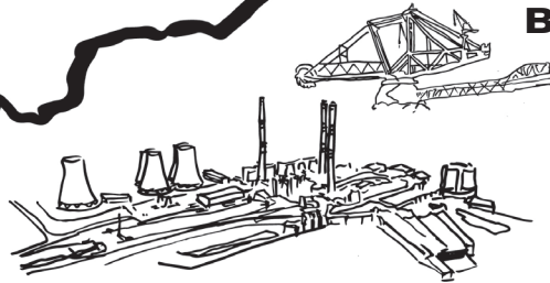
Počerady power plant